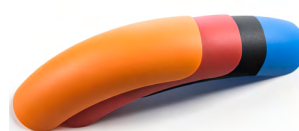
Colour-kit (mudguard) included in delivery