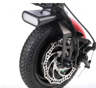
LED-light, Fender (accent colour red) and disc-brake (pictured on EMF070085 Drive wheel 8,5", solid tyre)