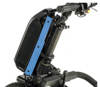
Colour-kit (sidebars) included in delivery (accent colour blue)