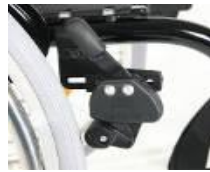
XFF060002 Knee lever brake