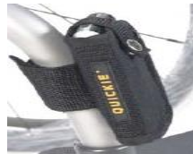
XFF090026 Mobile phone pocket