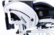
XFF040103 Aluminium, cold weather protection, fender