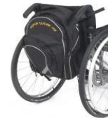
XFF090030 Back pack