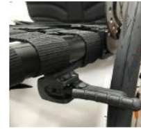
XFF060024 Lightweight compact brake EVO