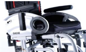
XFF04000x Desk sideguard, armrest, flip- up, removable