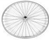
XFF070002 Design wheel