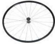
XFF070003 Lightweight wheel