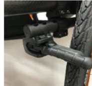
XFF060023 Compact brake EVO