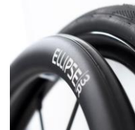
XFF070212 Handrims Ellipse 3R