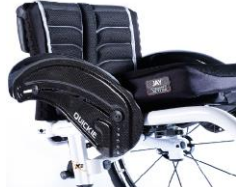
XFF040104 Carbon fibre, cold weather protection, fender