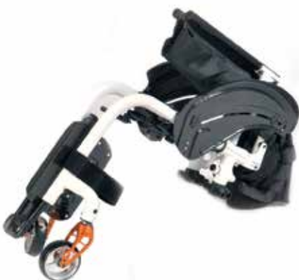
Wheelchair shown has half folding back option

The cross brace has been cleverly designed to sit neatly under the seat, leaving a minimalistic, open frame that has all the style of a rigid chair.