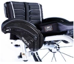
XES040104 Carbon fibre, cold weather protection, fender