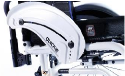
XES040103 Aluminium, cold weather protection, fender