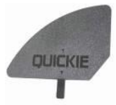
XES040107 Composite sideguard detachable