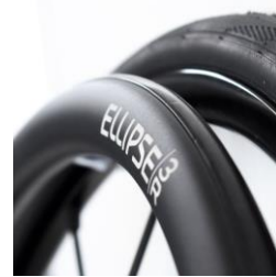
XES070212 Handrims Ellipse 3R