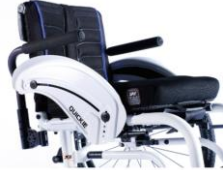
XES040117 Tubular armrest, swing away, removable, padded