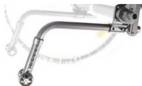
XES090050 Anti-tip tubes, plug in, pair